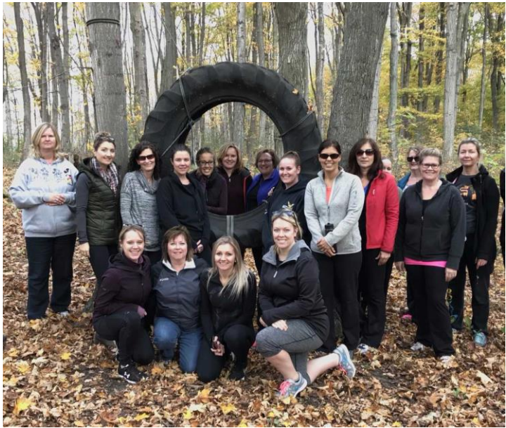
Exploring faith and growing our team at Faith Day 2017