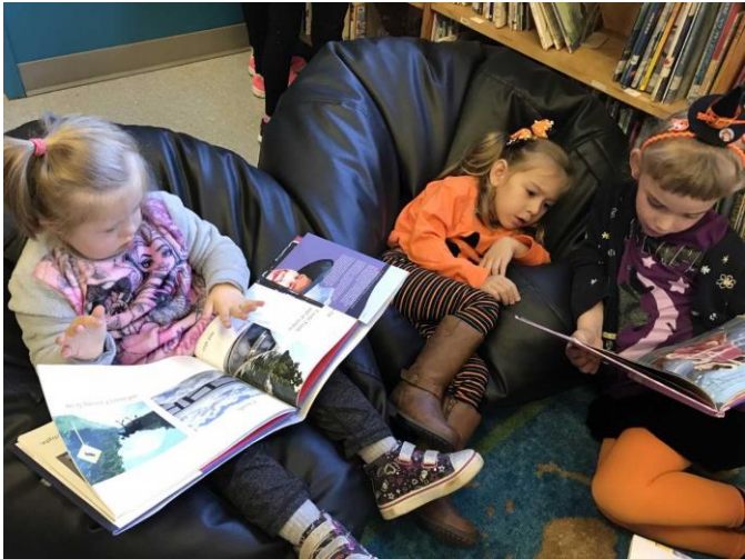
Shared reading time with friends